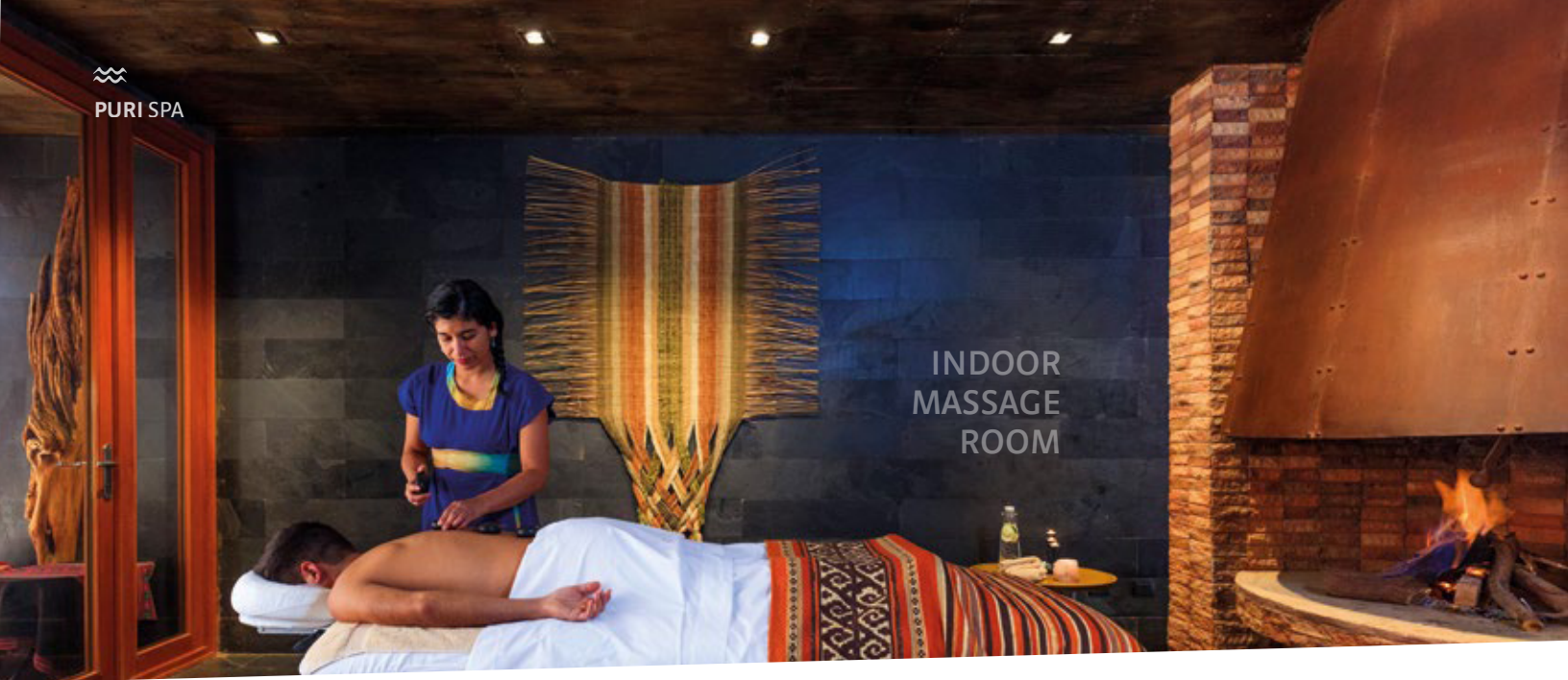
INDOOR MESSAGE ROOM